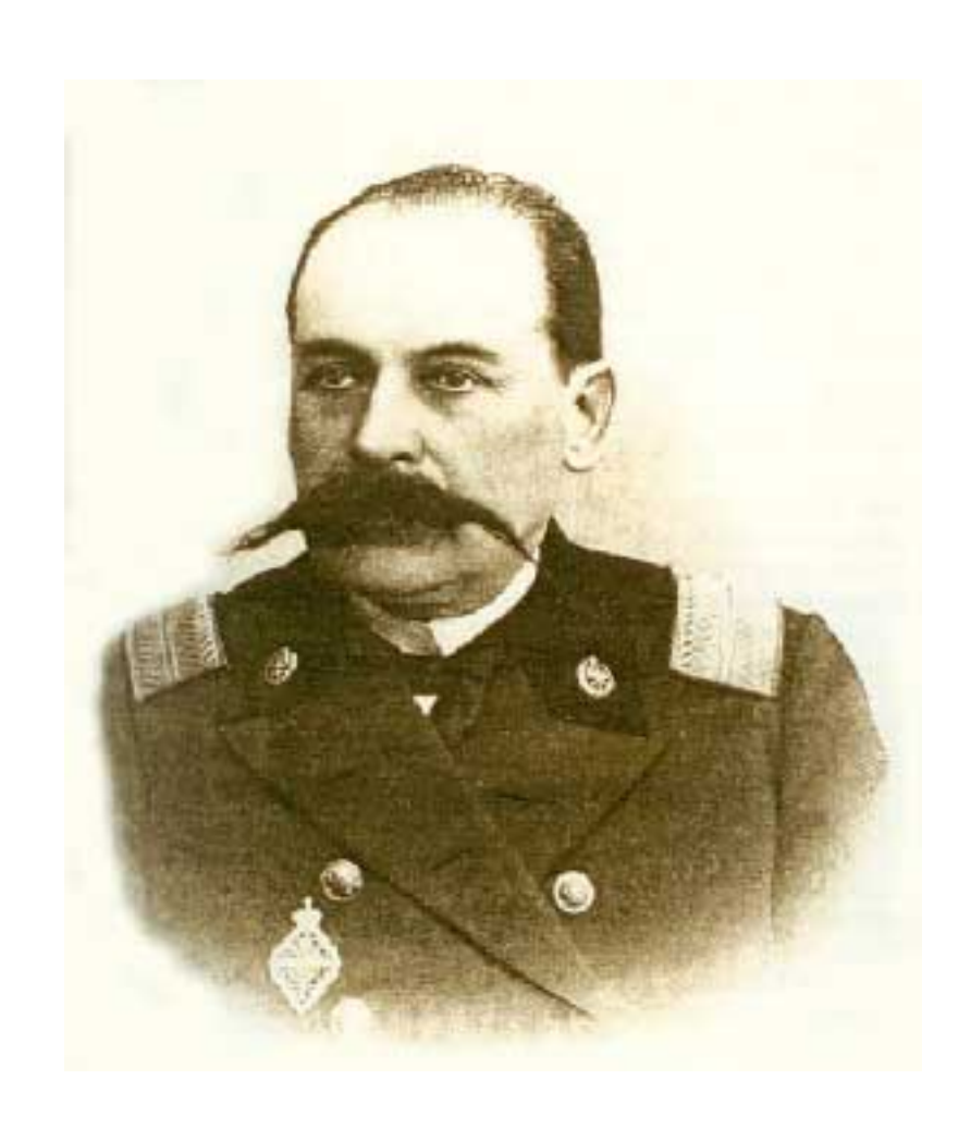
Ippolit Iosifovich Lyutostansky